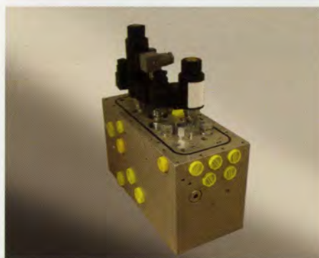
Figure 4: Subsea hydraulics: this block controls the drilling unit of a research ship which takes samples at depths of 2,500 metres.

With the new hydraulic system pressure build-up to initiate press movement is very rapid, despite the massive volumes of hydraulic oil moving round the system. The block also manages pre-charging and