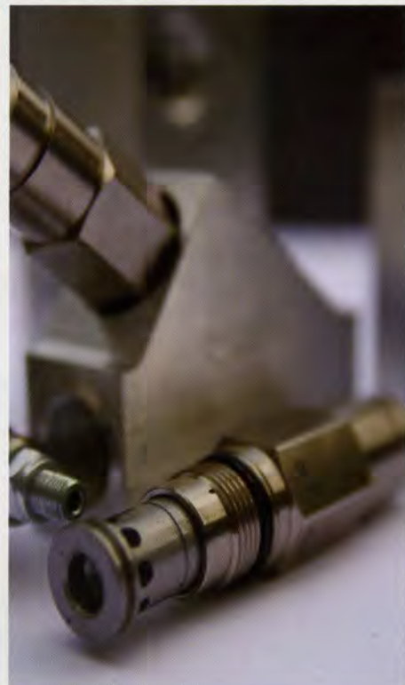
Figure 2: When it comes to selecting its screw-in valves, Ruppel Hydraulik has an unusually wide range at its disposal, so that special requirements can also be implemented in practical applications.

A typical project for mobile plant may involve the